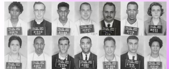
Booking photos of some of the Freedom Riders

For the period of seven months, these brave soldiers rode buses and sat in places that left them open and vulnerable to physical and verbal abuse.