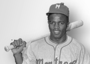
Jackie Robinson, Montreal Royals, 1946

Softball Games, NCC fundraiser, Location TBA, 6:00 PM– 8:00 PM – rain or shine