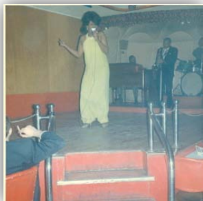
JACKIE ROBINSON MUSEUM