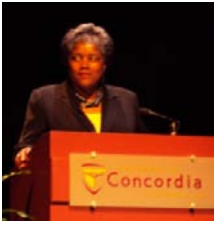
Ms. Donna Brazile